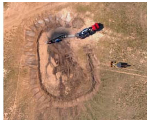
Pipeline under repair

Copyright © 2008 BAE Systems National Security Solutions Inc. All rights reserved. All trademarks used are the property of their respective owners.