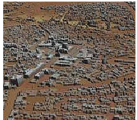
BuckEye LIDAR elevation model

In 2004, to address the need for field-expedient change detection capabilities to improve the speed of command, the TEC team developed BuckEye, an airborne digital imaging system that captures imagery and generates high-resolution geospatial data for use during tactical missions. The system includes a digital color camera and a LIDAR sensor to collect elevation data. A laptop computer controls the sensor and monitors data acquisition while in flight. It operates at a range of altitudes, depending on the required image resolution, swath width, and LIDAR point density — a variety of configurations can meet each tactical requirement — and is capable of acquiring more than 100 square kilometers of data per day. The combination of imagery and LIDAR makes it easier to produce precise, high-resolution digital elevation models of urban areas for strategic operations.